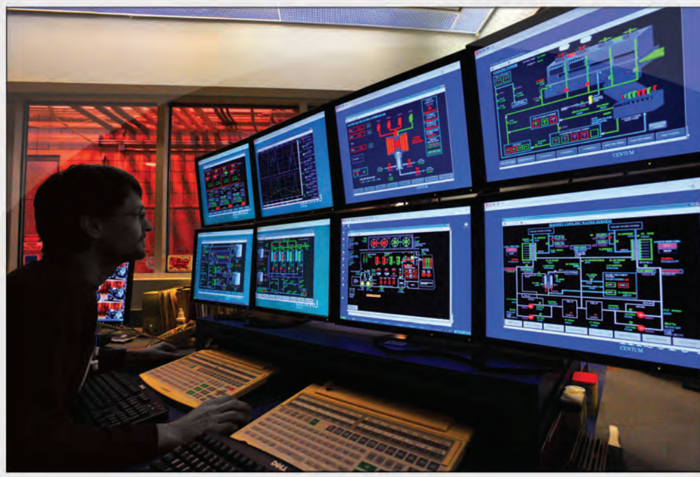
Multiple wide computer screens help control room technicians monitor magnet performance and make adjustments as needed.