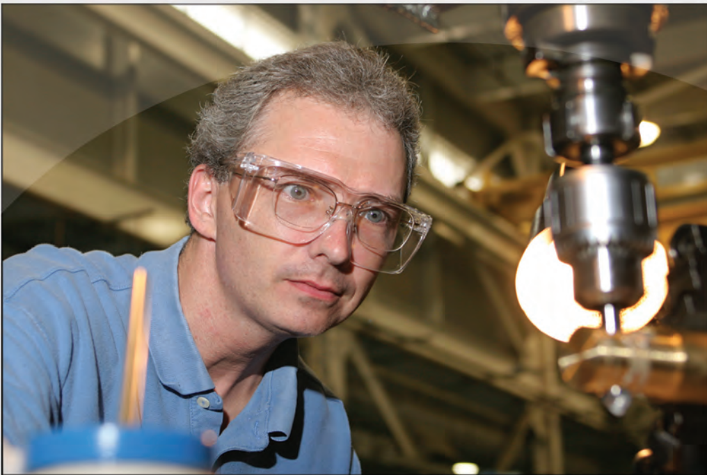
About 4,000 square feet of the lab's 370,000 square feet is devoted to a machine shop, where machinists operate a wide range of machinery.