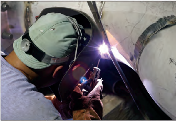
In 2006, the lab upgraded its megawatt capacity from 32 to 56 megawatts.