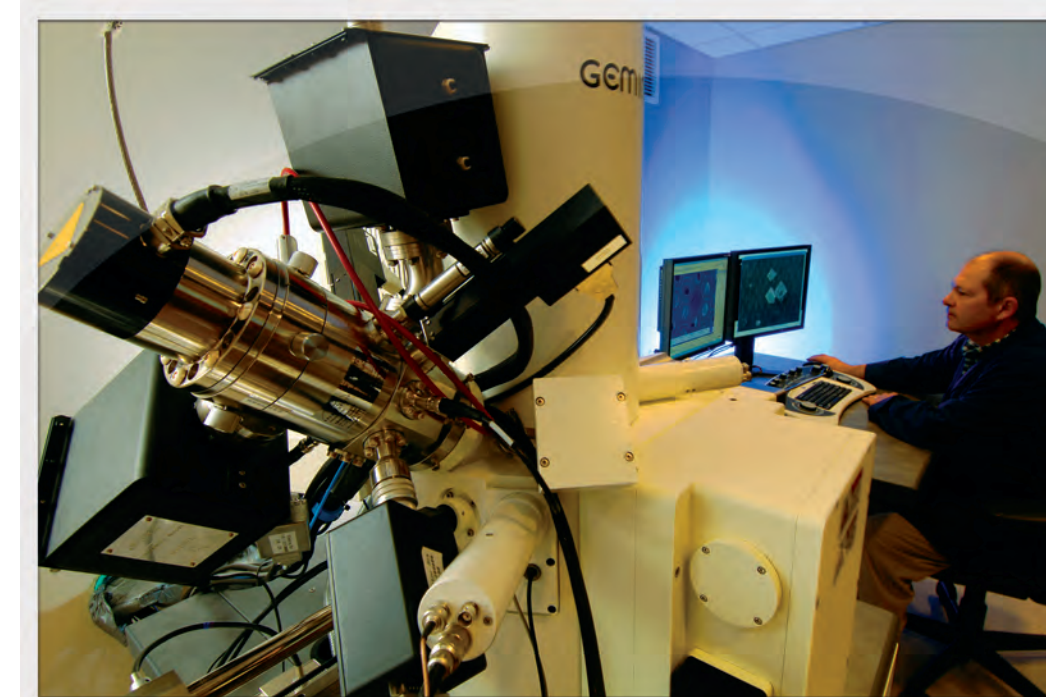
This scanning electron/focused ion beam microscope, one of two at the Applied Superconductivity Center at the Magnet Lab, is used to develop superconducting wires and tapes.

The Magnet Lab creates jobs not just in Tallahassee, but also across the state. According to the CEFA forecast, the state of Florida investment in the Magnet Lab between 2006 and 2016 will generate $1.66 billion in output (value of goods and services produced) and $689 million in income — generating 15,554 jobs across the state economy.