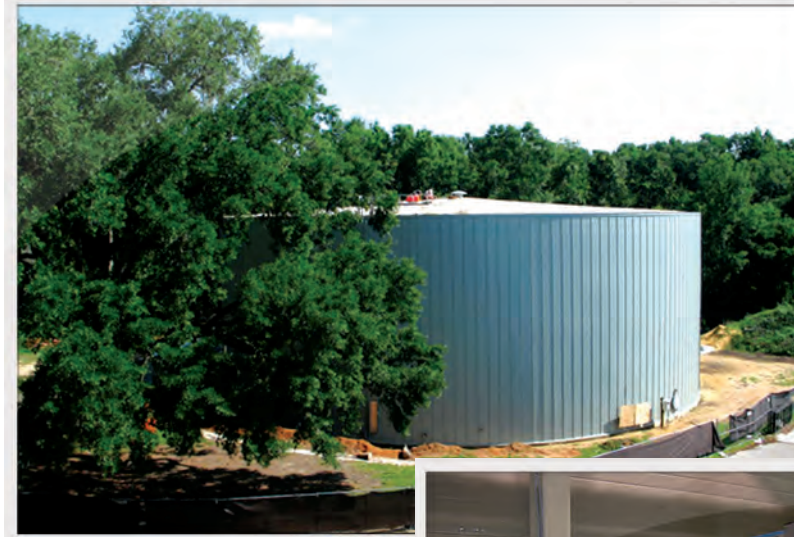
State support of the lab is critical to its success. In 2004, the Legislature allotted $7.5 million to upgrade the Magnet Lab's power and cooling infrastructure, which included the addition of this 3-million gallon, chilled-water tank.