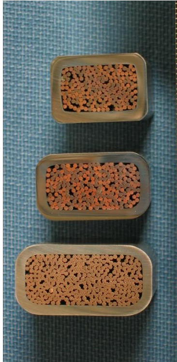
Full-Scale SCH Cable-in-Conduit Conductor Prototypes.

The production of the SCH CICC is not only a major milestone in the SCH project, it also serves to demonstrate much of the equipment that will be used to fabricate similar Nb 3 Sn CICC's for the International Superconducting Experimental Reactor (ITER) project.