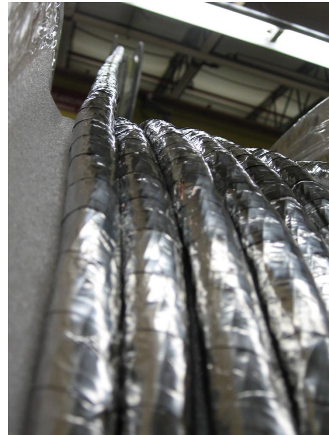
SCH Production Cables fabricated at NEWT, Inc. in Lisbon, NH