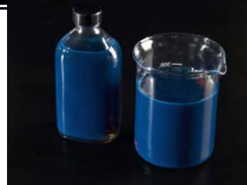
Figure 1. Strikingly blue crude oil from a Gulf of Mexico drilling platform.

A key step in crude oil production is injection of monoethylene glycol (MEG) to prevent formation of harmful gas hydrates. However, in a particular Gulf of Mexico platform, the recovery of MEG from a bright blue crude oil (see Figure 1) was prevented by formation of unknown deposits.